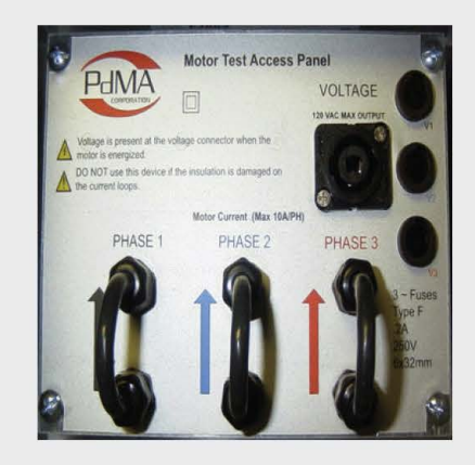
MTAP - Courtesy of PdMA Corp.

Although not specifically mentioned in Table 130.5(C), opening an EMSD cover like that of an infrared window does not expose bare conductors or circuit parts, and to our interpretation and verified by others we have spoken to who were on the NFPA 70E Technical Committee, is that no PPE would be required. In this manner, the use of an EMSD and changing work processes to keep equipment in a closed and guarded condition while performing CBM tasks falls into the "Substitution" method guidelines of the Hierarchy of Control.