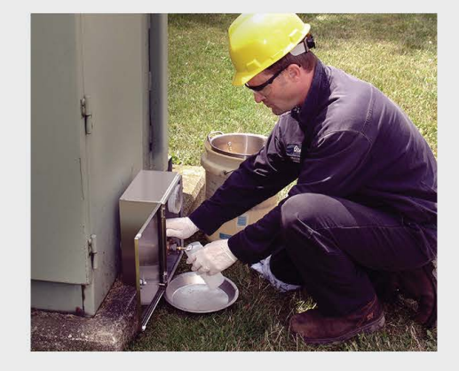
External Oil Sampling - Courtesy of SDMyers